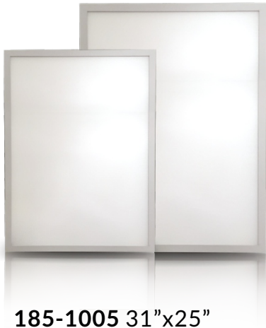
185-1005 31"x25" Small Snap Frame